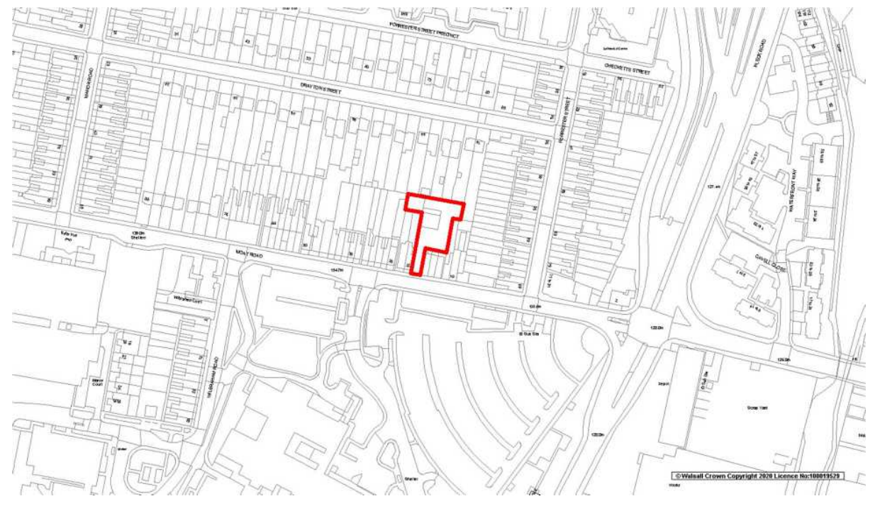
Page 87 of 130