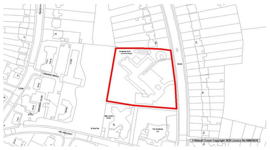
Page 64 of 130