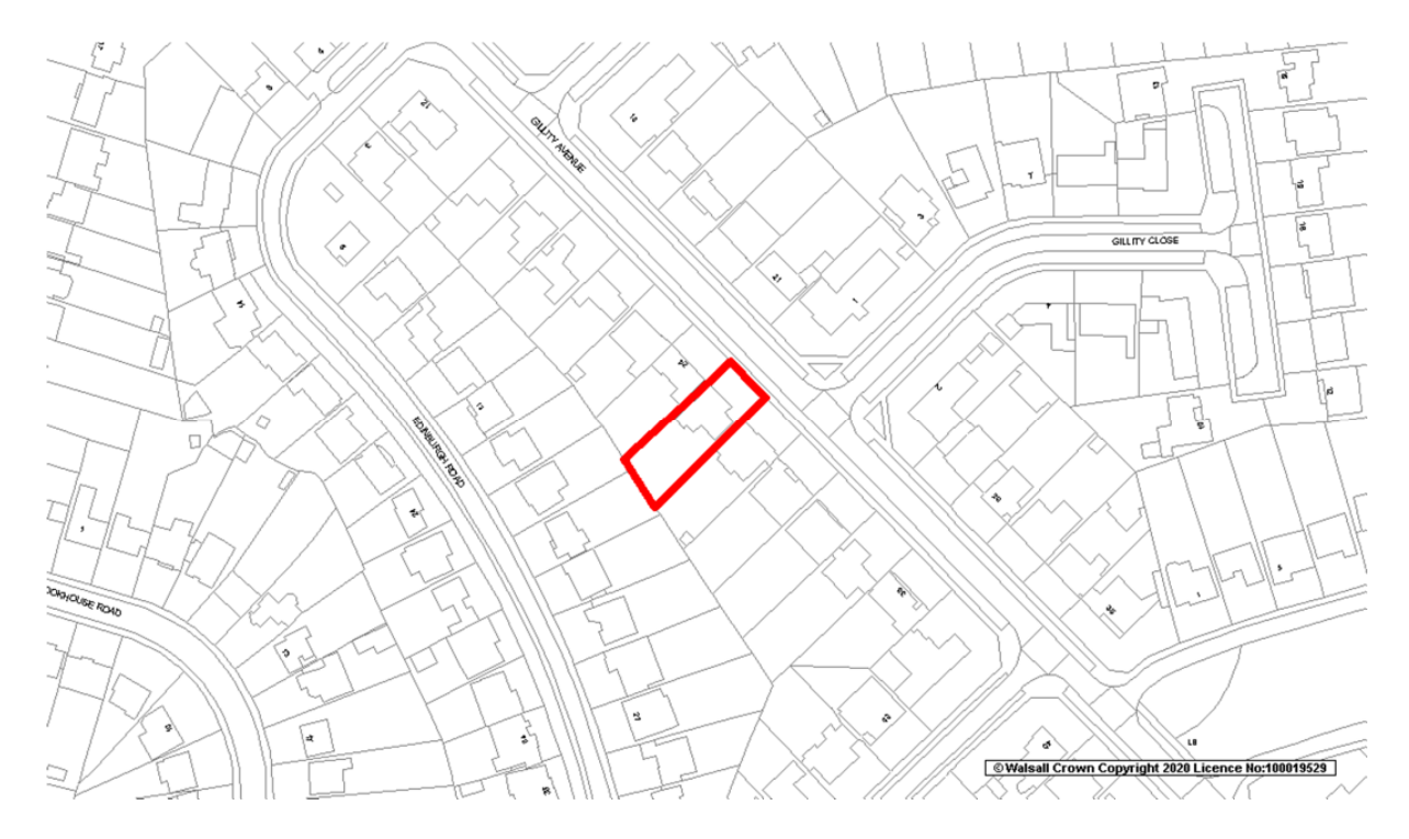
Page 119 of 130