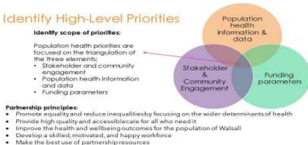
Diagram 1 3

To ensure alignment to national principles, the approach agreed at Place level aligns to the national ambition of The Core20Plus5 agenda, highlighting the key inequalities for the 20% deprived across the Country are now a priority. As a system, Black Country ICB agreed six areas, rebranding to The Core20Plus6 from the most deprived 20% of the national population with health outcomes inequalities identification. The