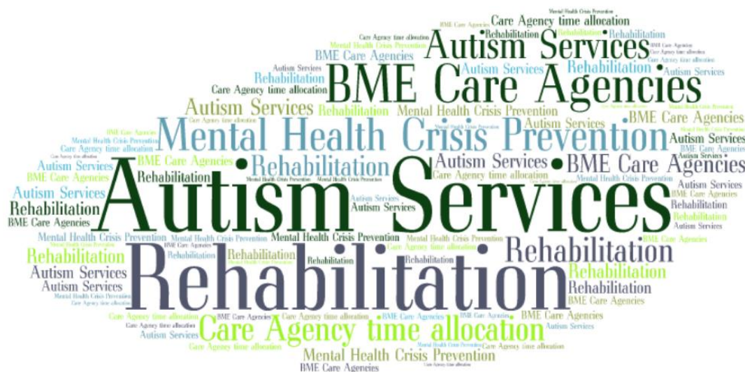
Figure 2: Additional areas of concern about Community Care expressed by the public

Whilst these additional key areas are all important, they have not featured strongly in feedback from the public and cannot therefore be selected as Healthwatch Priorities.