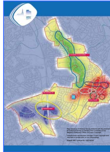
WRC Designated Area (780 Ha)