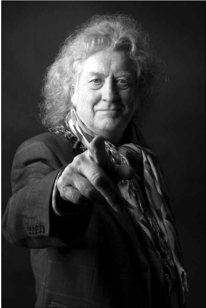
Neville John (Noddy) Holder M.B.E.