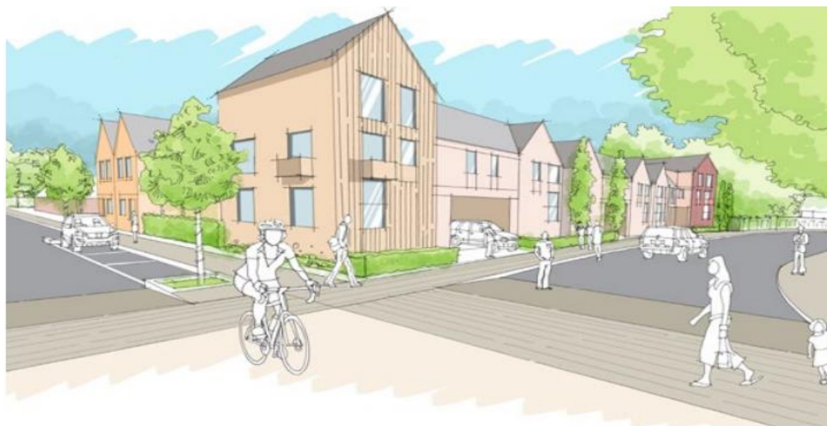
View of parcel E - Junction of Villiers St and Cemetery Road.