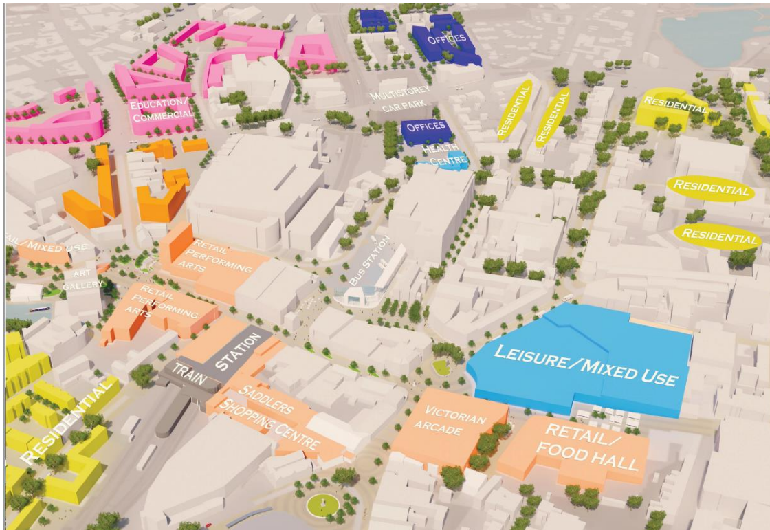
Town centre masterplan