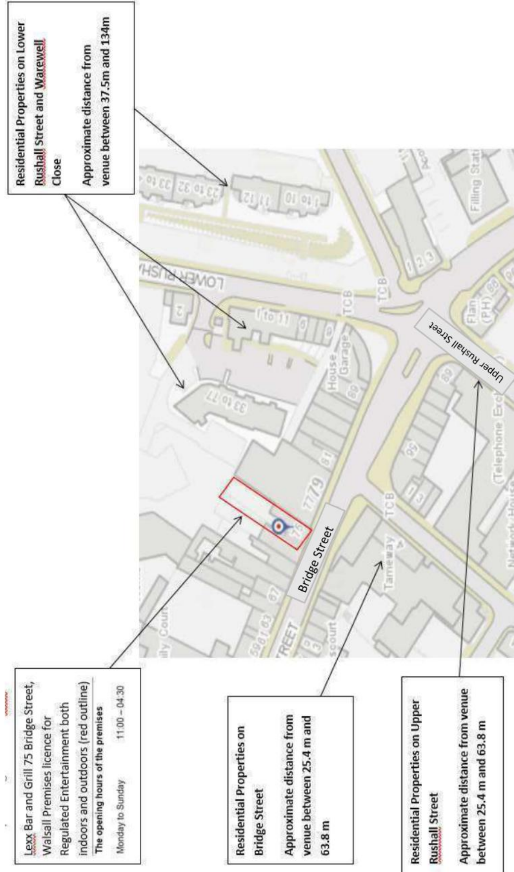
Map showing location of Lexx Bar and Grill and proximity to Residential establishments