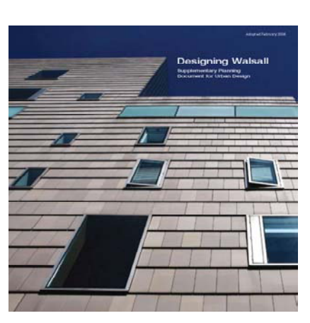
Designing Walsall SPD