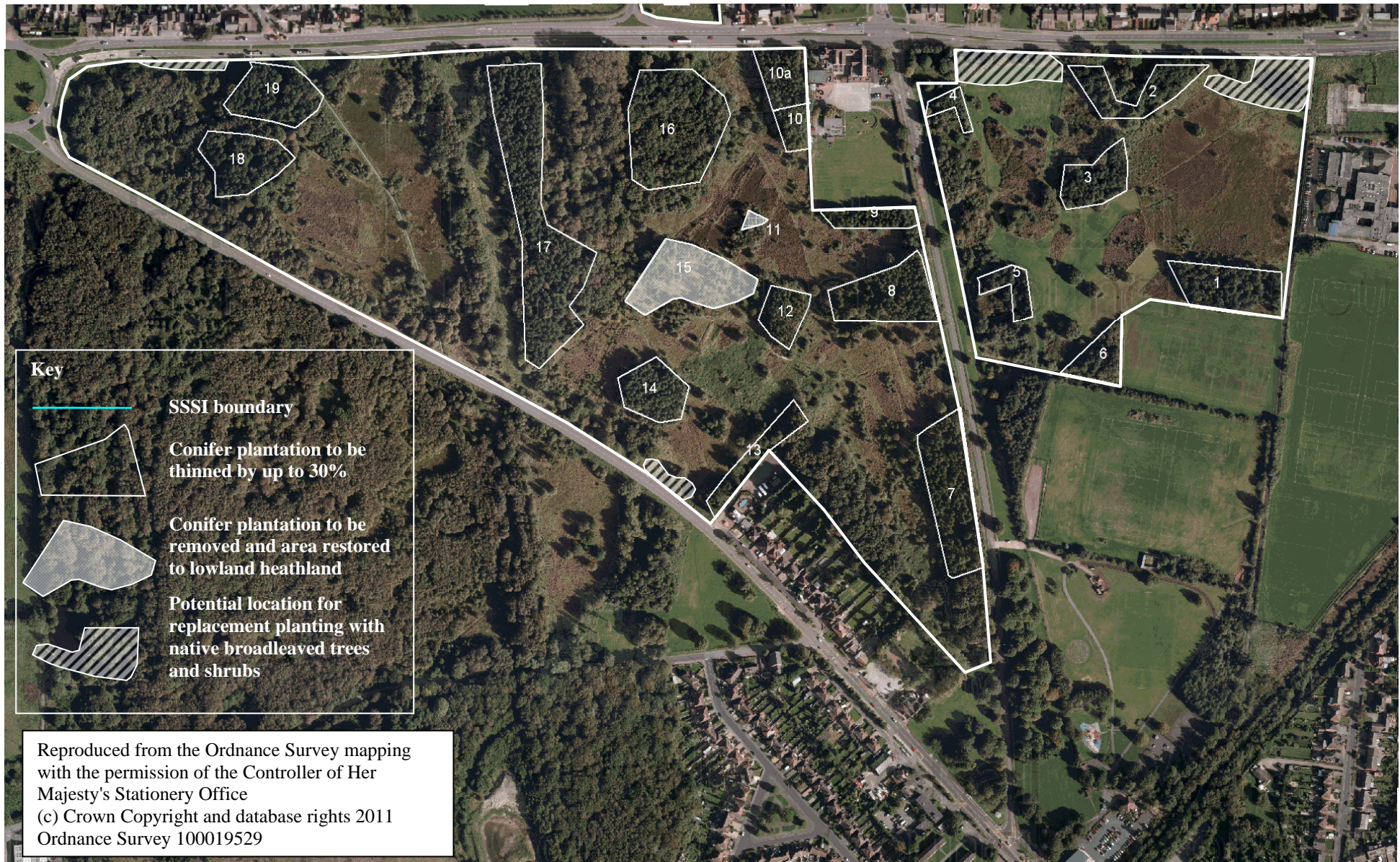
Figure 2. Brownhills Common Conifer Plantations