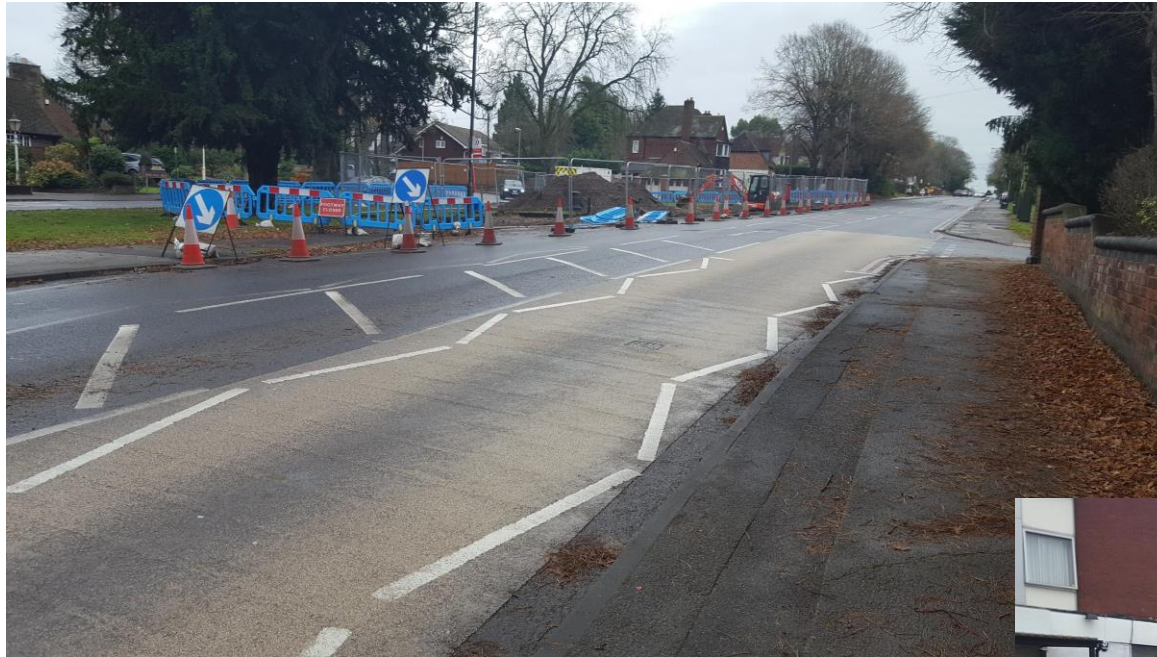
A34 Birmingham Road – Queens Road and approach to Broadway junction.