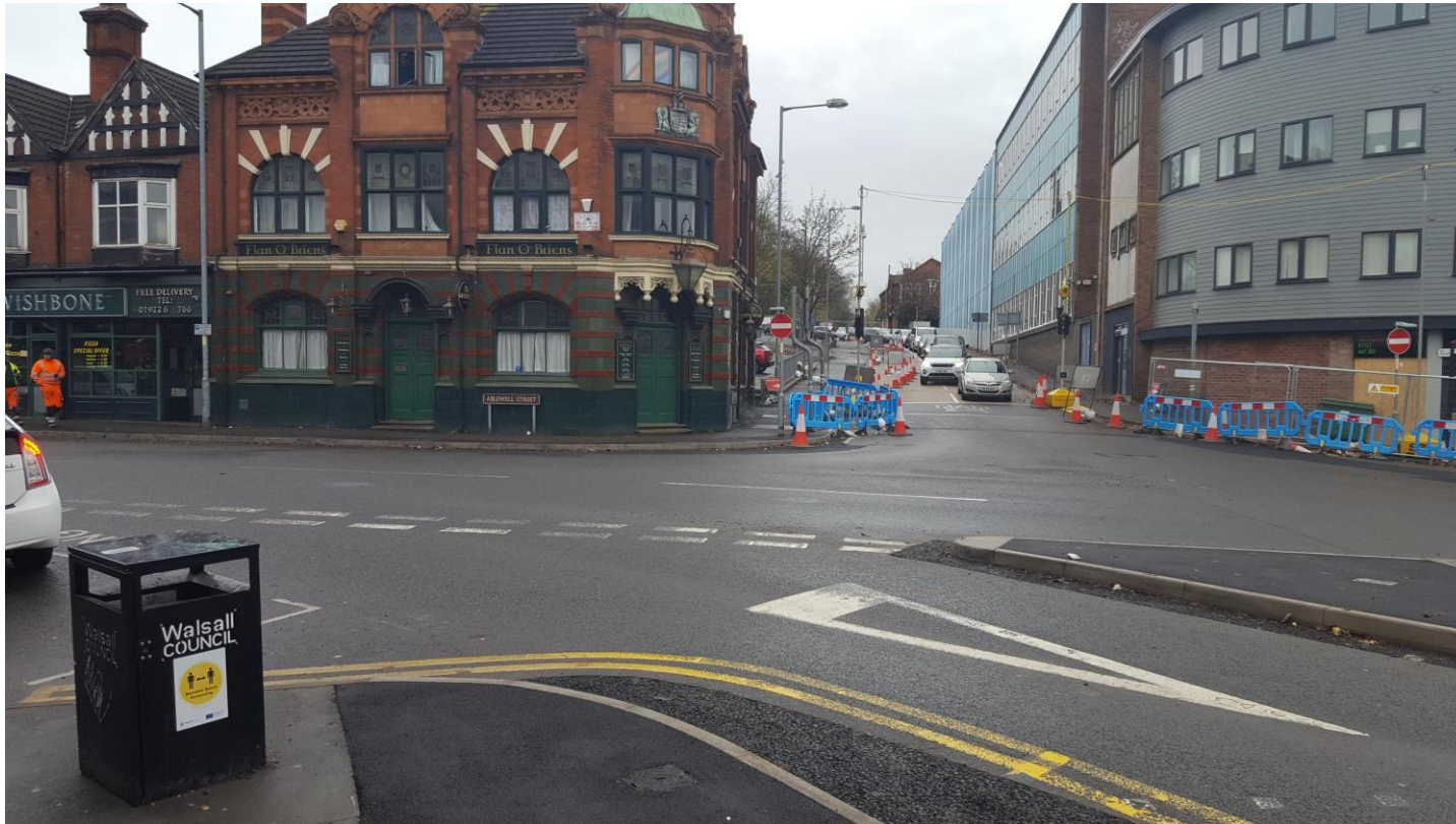
Ablewell Street / Upper Rushall Street Junction.