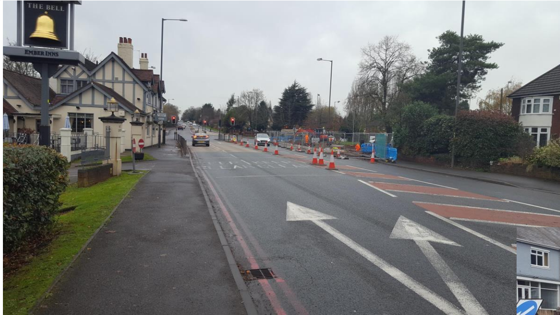
A34 Birmingham Road / Walstead Road junction.