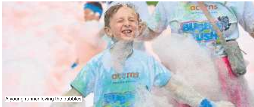
A young runner loving the bubbles