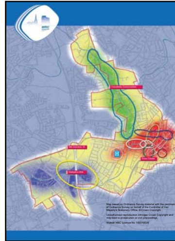
WRC Designated Area (780 Ha)