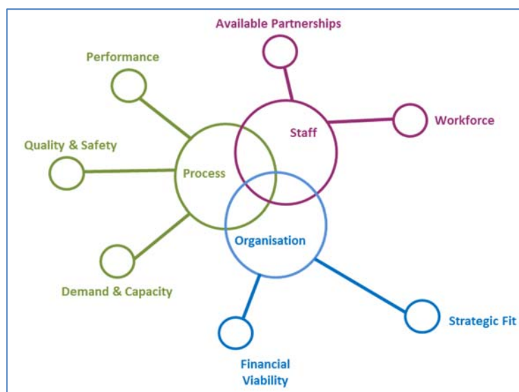
Figure 1: Walsall NHS Sustainability Model

Sustainability reviews will become a rolling annual programme undertaken during quarters 2 and 3 for services where there is a specific area of concern.