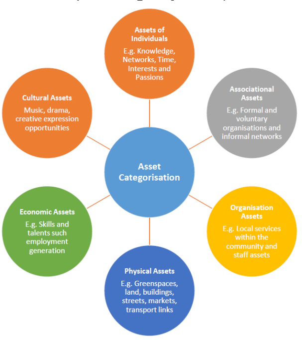
Figure 2 – Asset Categorisation (Adapted from Foot and Hopkins, 2010)

(Improvement and Development Agency, 2010).