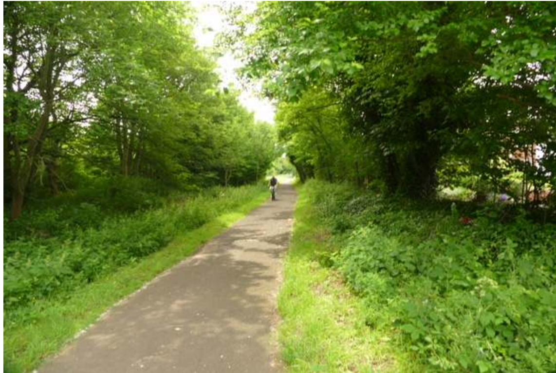
National Cycling Route 5 with a cyclist heading toward Brownhills