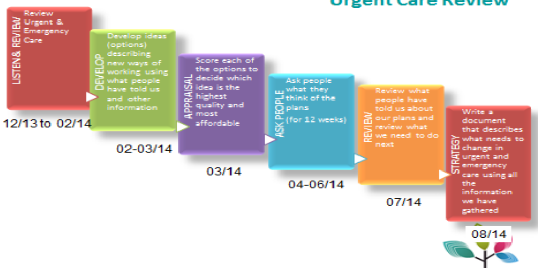
Urgent & Emergency Care Strategy Development inc. Urgent Care Review

The chart below describes the progress that is being undertaken to develop the strategy.