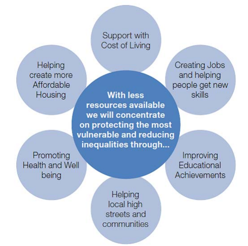
Figure 1- our priorities

Our vision, objectives and priorities, underpinned by our values are expressed in the Corporate Plan 2015-2019 'Shaping a Fairer Future', and summarised in figure 1 below.