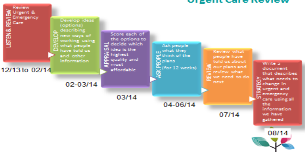
Urgent & Emergency Care Strategy Development inc. Urgent Care Review

The chart below describes the progress that is being undertaken to develop the strategy.