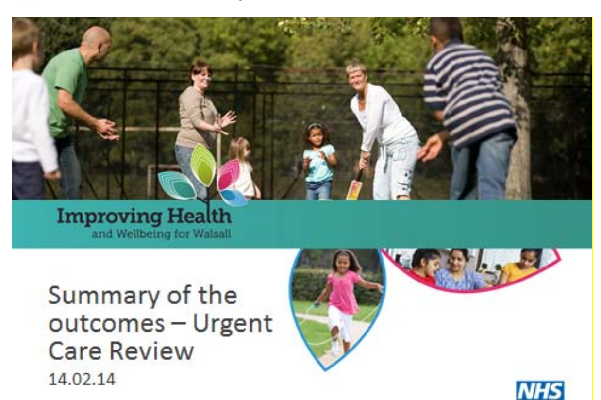
Appendix 1 – Outcomes of the Urgent Care Review – Feb 14