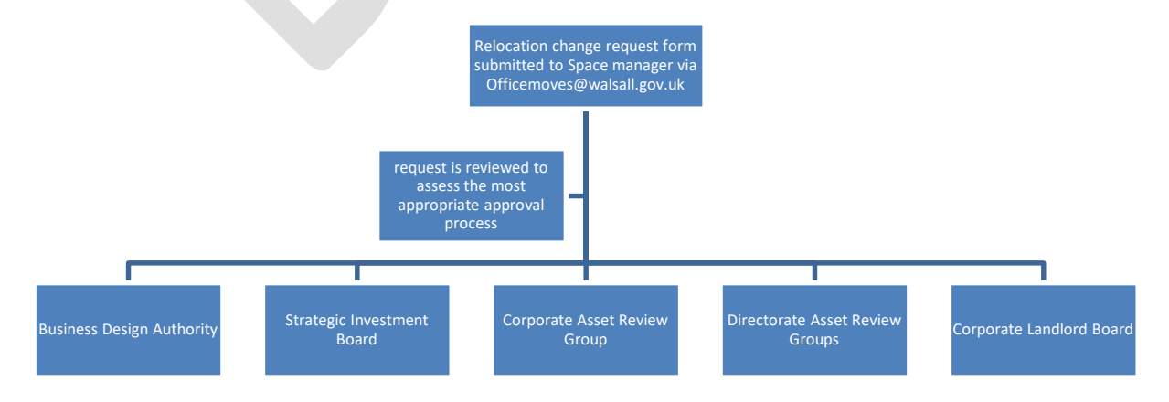
Figure 3 'process for change' approval considerations

The application document will be reviewed to ascertain the most appropriate path within the approval process which will differ dependent on the size, scale and impact of the change. The outline brief will then be developed further with the requesting service and passed through the relevant approval process.