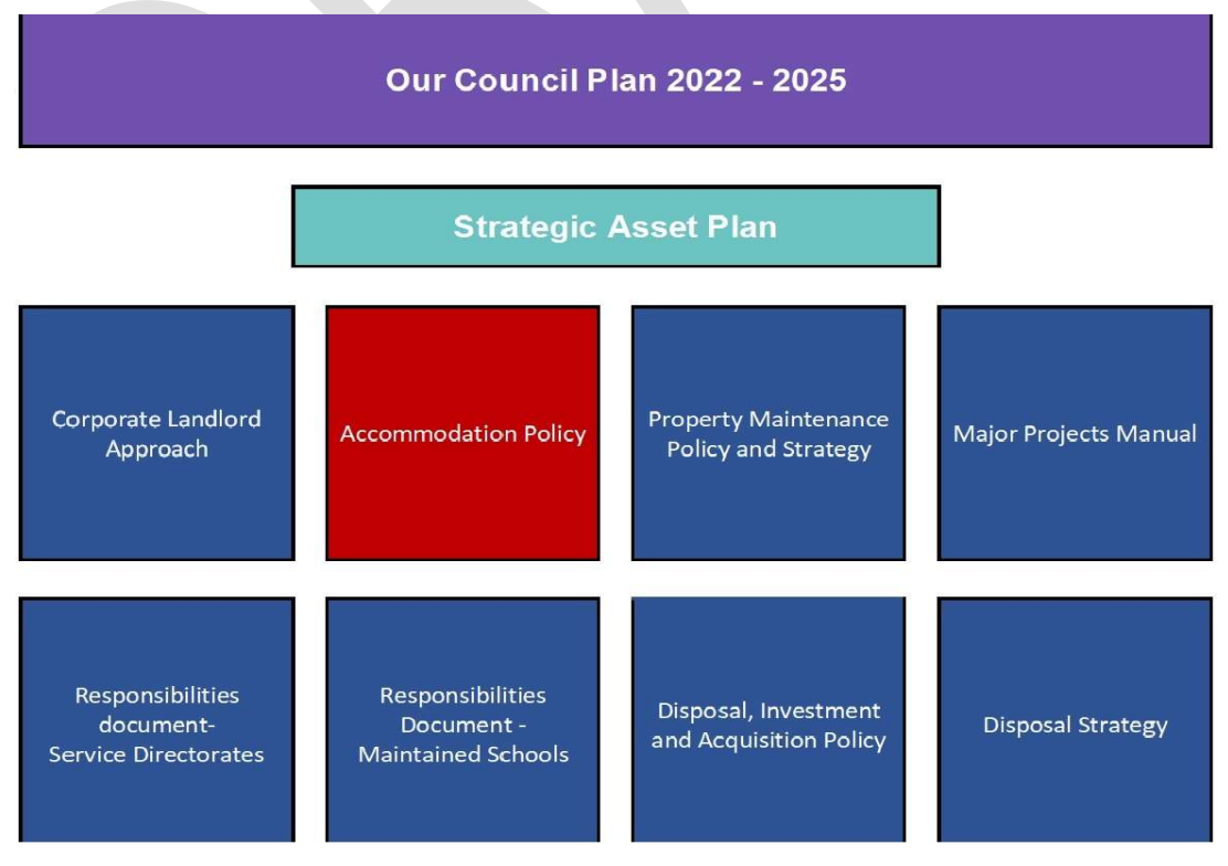
Figure 1- Strategic Asset Plan content

The diagram below demonstrates how the policy sits within the SAP supporting documents which in turn supports the aims of Our Council Plan 2022- 2025