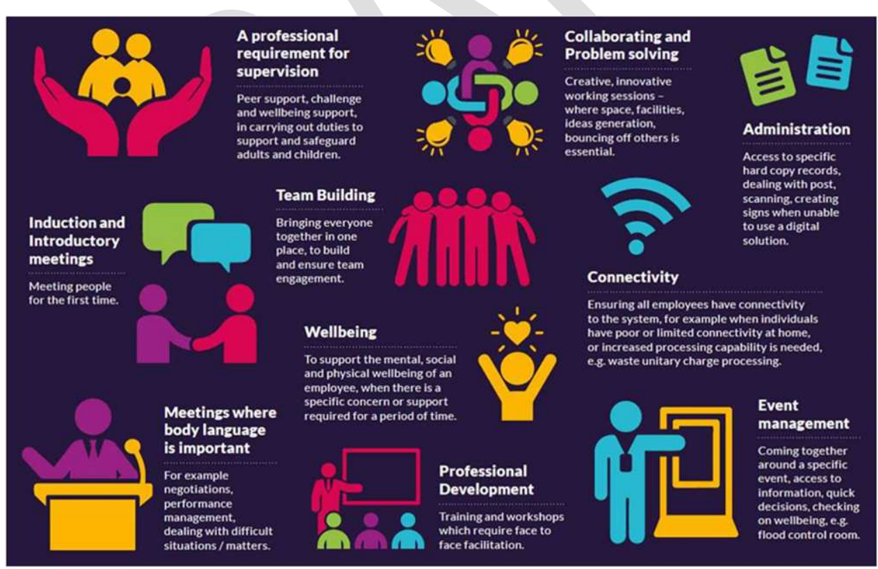
Figure 2 Presence with a Purpose Principles

By adopting these principles in addition to continually monitoring space requirements tour organisation will be able to achieve the most efficient estate possible.