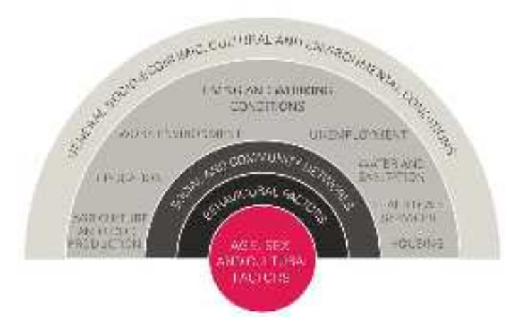
Figure 1. The factors that influence an individual's health and wellbeing.

Source: Whitehead M, Dahlgren G. What can be done about inequalities in health? The Lancet. 1991;26(338)8774:1059-1063.