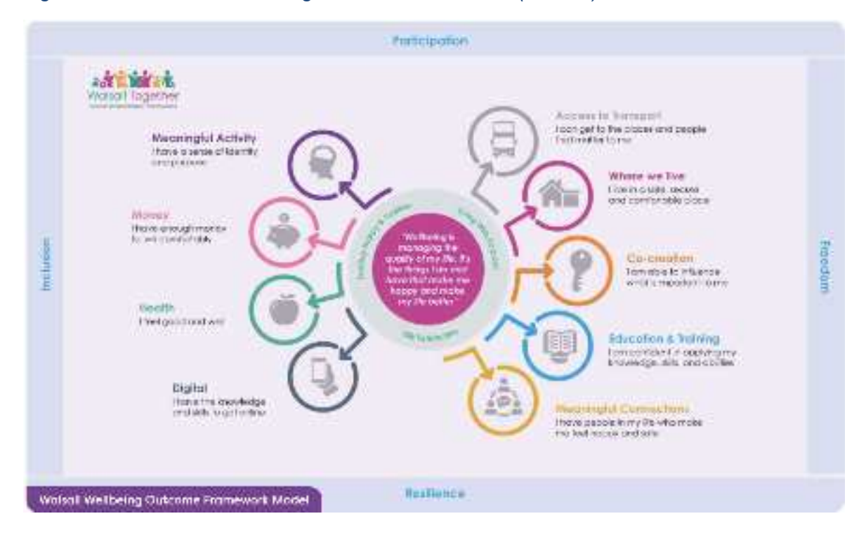
Figure 2. The Walsall Wellbeing Outcome Framework (WWOF) Model.

3.3 The Public Health Outcomes Framework (PHOF) sets out a high-level overview of public health outcomes, at a national and local level. An interactive web tool makes the PHOF data available publicly. This allows local authorities to assess their status in comparison to national averages and their peers, and develop their policies, strategies and work plans accordingly.