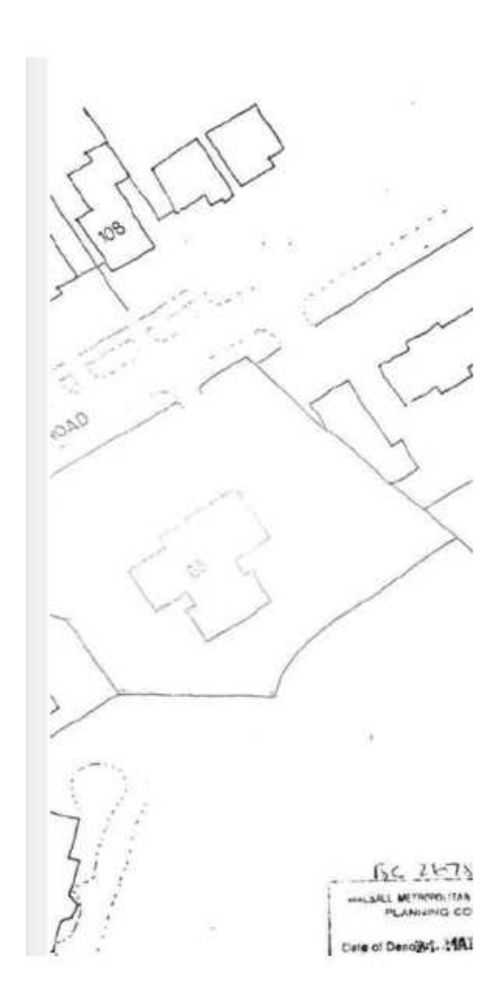
Figure 1: 85 Stonnall Road as stood in 1989