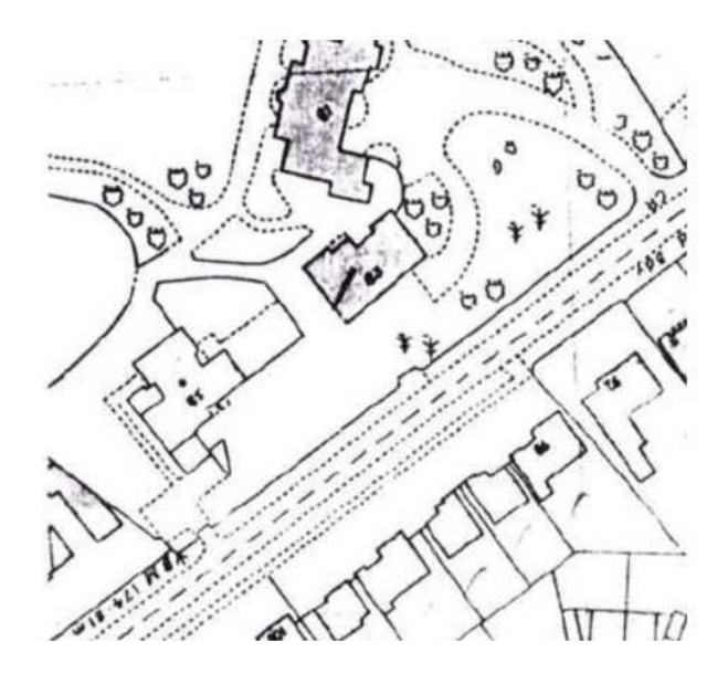
Figure 2: Block plan of 85 Stonnall Road as stood in 1989. Neighbouring properties are shown.

The above historical drawings show 85 Stonnall Road as the property stood in 1989. Although there is planning history on this site to indicate there have been various developments allowed; the dwelling does not appear to differ in its footprint to current day other than the area of hardstanding to the front of the dwelling. As such, it is considered that the current proposal would be acceptable as it would not result in disproportionate additions to the original building (original in the sense means as first built or as it existed in 1948) given the modest size of the proposal in comparison to the two-storey detached dwelling.