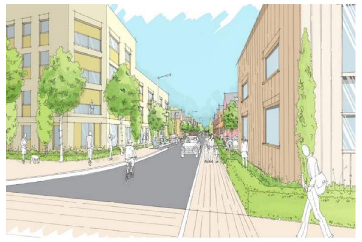
View 1 - Looking from the War Memorial down Moat Street