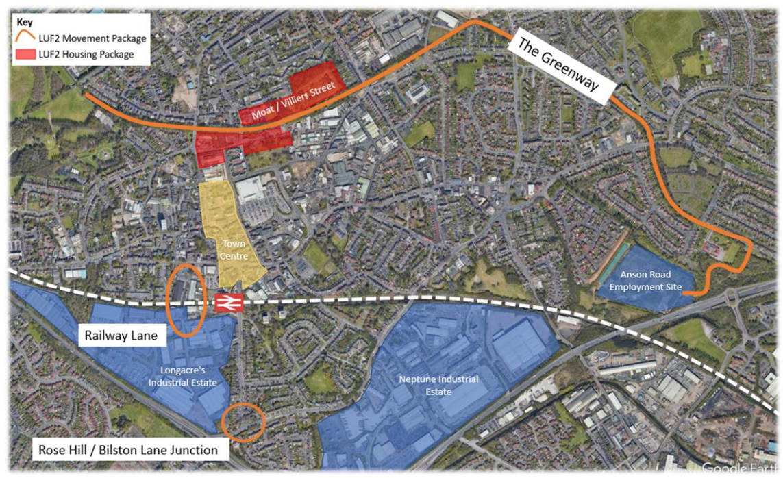
Locations of the three Movement Package sites