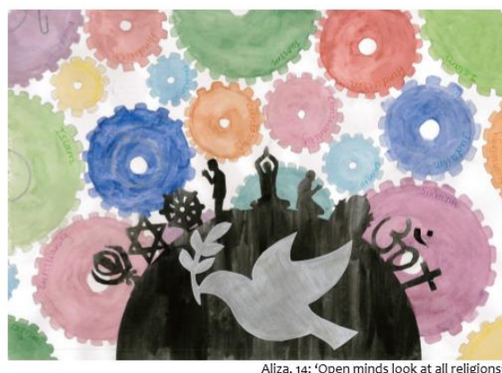
Aliza, 14: 'Open minds look at all religions'