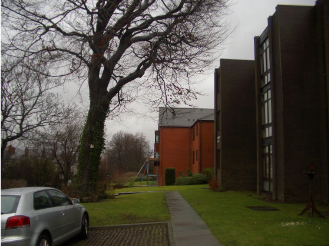
Photograph of the Beech tree taken from the north.