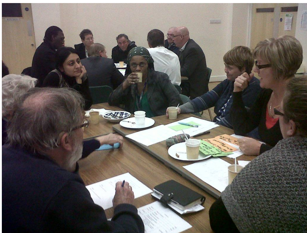
Attendees at a recent Area Partnership meeting

The Area Manager and local councillors have been working together to discuss the best ways forward to ensuring local residents are engaged in the work of the Area Partnership. Activity is due to begin on developing three local community fora to reflect the needs of each area. Representatives from each area will be able to attend Area Community and Partner meetings and advocate on behalf of their area to ensure effective and fair contributions are made.