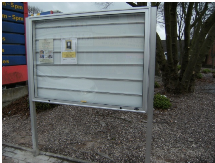
The new notice board on the High Street, Brownhills

One of the issues raised in the Area Plan is the need for improved signage in Brownhills including a notice board to inform people of upcoming events and initiatives. The location for the notice board is important as it needed to be in prominent position so that it would be seen by local residents and traders. In partnership with the Brownhills Town Centre Partnership, the Area Partnership provided funding to purchase a new notice board which was erected on the High Street by Street Pride.