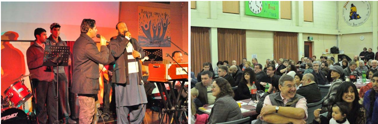
Entertainers and audience at the launch of the Caldmore Village Festival

The launch of Caldmore Village Festival has taken place with a taste of the event. Over 200 people attended including local residents, local councillors, the Area Manager, local businesses and partner agencies. It was a very successful night with entertainment from a variety of local talent.