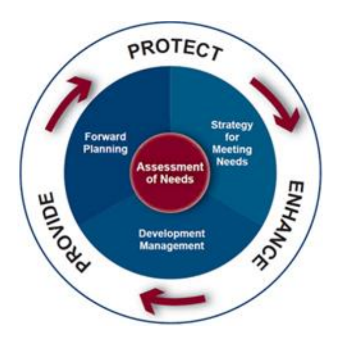
Figure 1: Sport England themes

To provide new outdoor sports facilities where there is current or future demand to do so